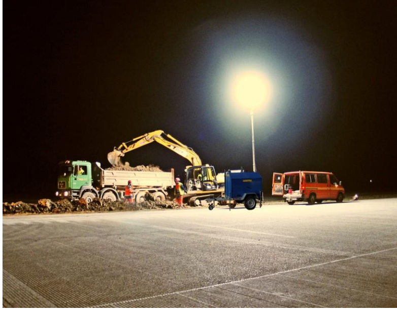
LumiTrail 4000 in construction