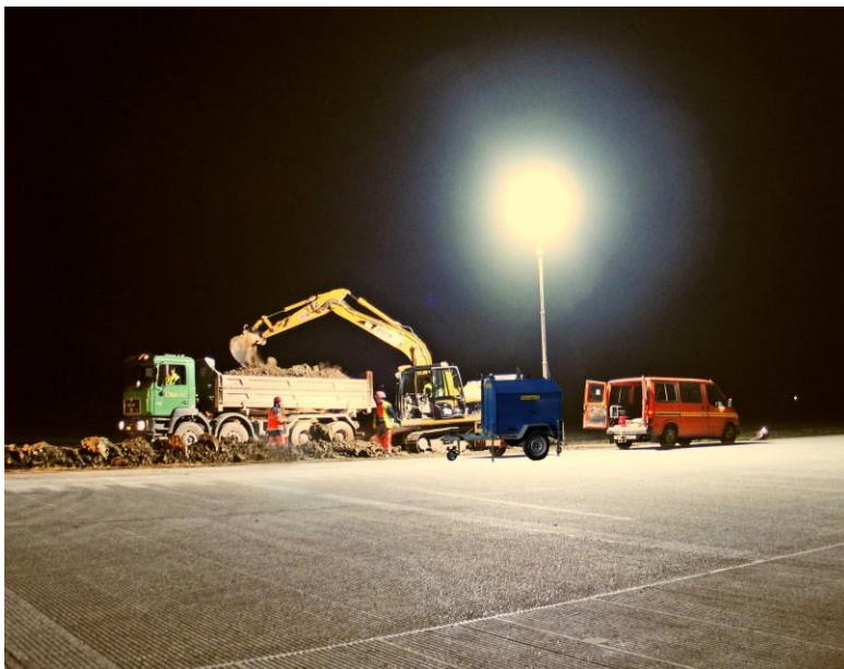
LumiTrail 4000 in construction