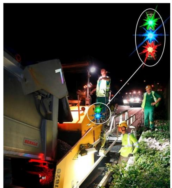
Finisher equipped with a pair of TriLED